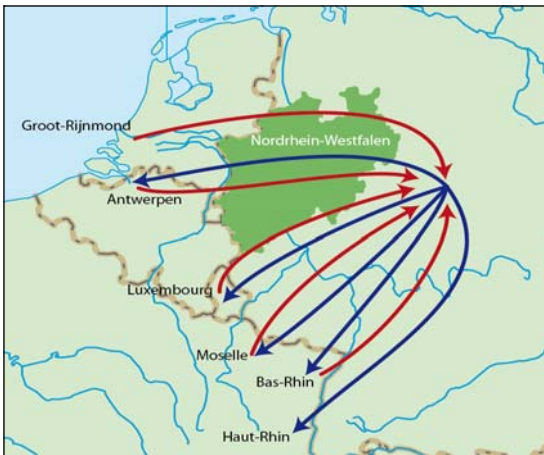
Germany's main truck flows

In addition to exclusive Ti data, the report also includes a round up of key governmental statistics, including the split between in-house and own account road haulage, and between the various modes.