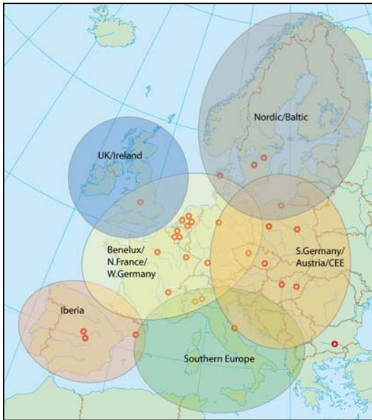
Distribution hub reach—Europe

Global Distribution & Warehousing 2008 details the main trends affecting the development of national, regional and global distribution hubs. In addition it provides profiles of some of the leading property development companies as well as a ranking of the largest logistics centre operators.