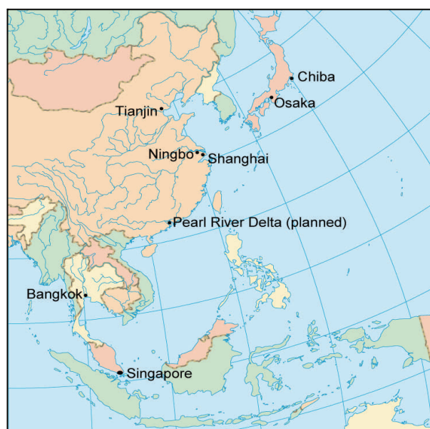
Key chemical logistics locations in Asia Pacific