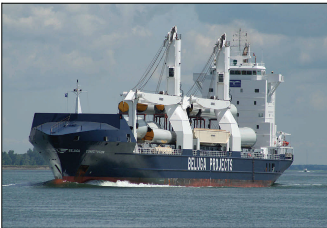
Project Logistics set for sustained growth