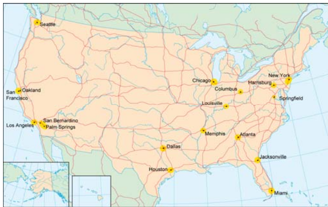
USA: main distribution clusters