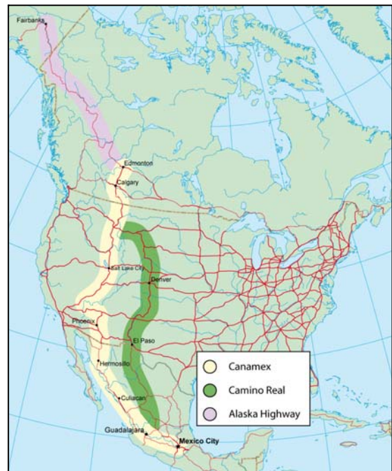
North America: The Central Western Corridor

Despite the current weak economic climate, logistics development in the Mexican market shows considerable growth potential. US manufacturers are continuing to relocate south of the border looking for lower cost production, whilst maintaining quick response. Improvements in infrastructure will strengthen this trend.