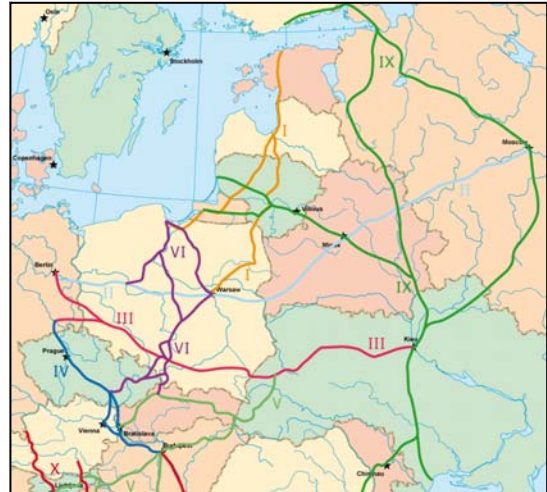
Pan-European Transport Corridors

The report also contains information on the key airports and ports, and includes information on the Russian domestic road network as well as a detailed analysis of Russian Railways.