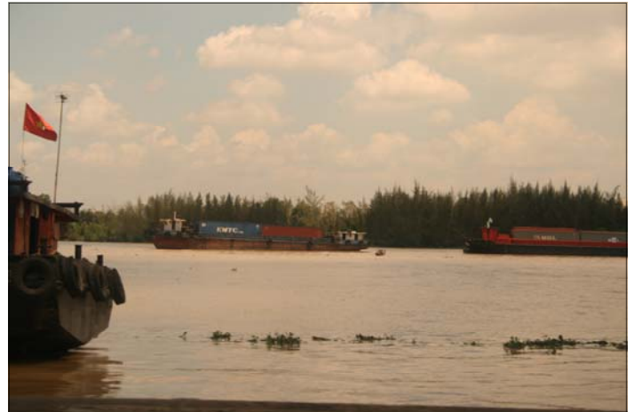
Vietnam: waterways are an important mode

In particular the report deals with the issues facing the country's ports sector and how these will only partly be solved by the government's current investment strategy. Future growth in all modes will be held back by infighting between local and regional bureaucracies and an excess of red tape.